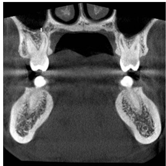
Fig. 2. Screen capture shows the distance between the root apex of the maxillary posterior teeth and maxillary sinus floor (white line).

In the coronal and sagittal slice images (Fig. 1A and B), the CBCT images were adjusted until the horizontal blue lines were parallel to the occlusal plane. The sagittal CBCT images (Fig. 1B) were adjusted until the vertical red line in the coronal slice images (Fig. 1A) was perpendicular to the occlusal plane and passed through the root apex to be measured. The coronal CBCT images (Fig. 1A) were adjusted until the vertical green line in the sagittal slice image was perpendicular to the occlusal plane and passed through the root apex to be measured.