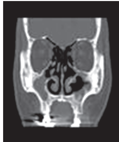
Fig. 7. Postoperative computed tomography views at 2 years showed thickened mucosa of the maxillary sinus, but reconstruction of the orbital floor was maintained stably.