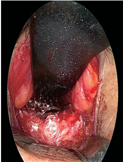
Fig. 3. Intraoperative endoscopic image shows reconstruction of the orbital floor via a subciliary incision with absorbable plate and screw.