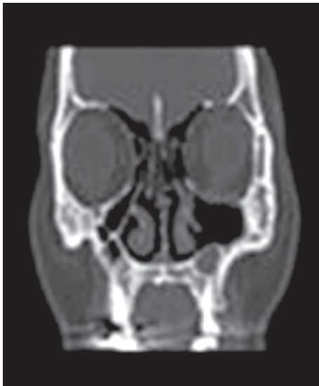
Fig. 6. Postoperative computed tomography scan shows a stably reconstructed orbital floor.