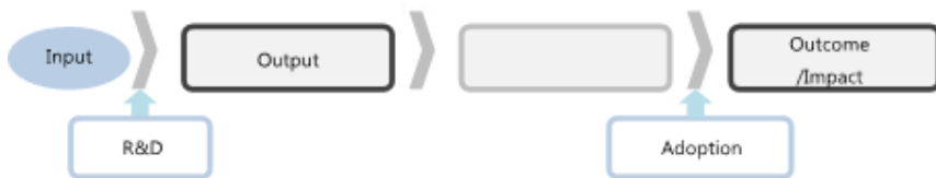
Figure 1 Types of impact of public research

The technology valuation method is a logic model consisting of eight steps of assessment, constituting two different approaches. The model starts from the identification of objects for assessment. In many cases, an output or outcome is a result of different researches. On the contrary, a research yields different outputs. Therefore, a cleaning of output or outcome is needed. In addition, the scope and time span of output or outcome are important at the identification stage.