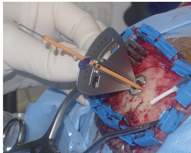
Fig 3. Intraoperative photograph showing the adjustable Ghajar guide used for the ventriculoperitoneal shunt.

Between October 2014 and December 2015, the adjustable Ghajar guide technique was applied to 20 patients and prospective data collected on the operative procedures (adjusted angle of catheterization from orthogonal trajectory, number of catheter passes) and postoperative CT. Based on the post-