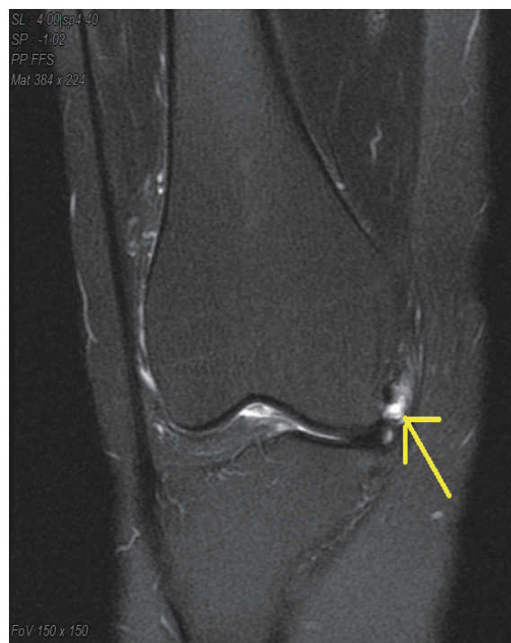
Fig. 2. Right knee MRI of case 2 (12/26/2016)