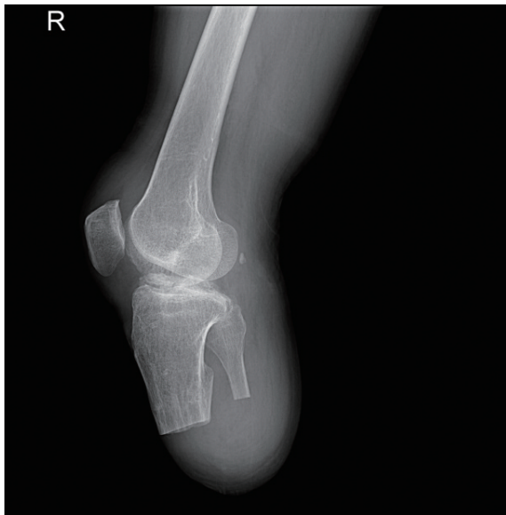
Fig. 1. Amputation below right knee X-ray

day (9:00 a.m. and 2:00 p.m.) during the patient's hospitalization and done using disposable stainless-steel needles 0.20mm in diameter and 30mm in length (Dongbang Acupuncture Inc., Korea) for 15 minutes. In the morning, acupuncture was applied at Sinjeongkyuk (腎正格), Hapmok (合谷, LI4) with no stimulation. In the afternoon, the patient was treated at ten acupoints on the unaffected side, Baekhoe (百會, GV20), Sasinchong (四神總, Ex-HN1), Sakwan (四關), Taebaek (太白, SP3), Joksamni (足三里, ST36), Sinmun (神門, HT7) with manual stimulation of rotation. The depth of needle insertion was 5~15 mm. Needle sensation including de-qi was not vigorously sought. The acupuncture treatment was performed by two Korean medical doctors with 8 years and 3 years of clinical experience.