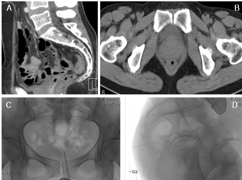
Fig. 1. Pelvic CT (A, B), MP (C) and colostogram (D). No abnormality was found in radiologic examinations.