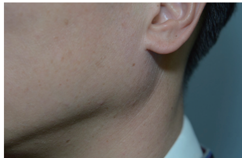
Fig. 1. Preoperative photograph showing a lesion on the left neck.

Occipital artery pseudoaneurysms are rare vascular lesions, and are most often reported as a consequence of trauma [1,2]. We report the rare case of a