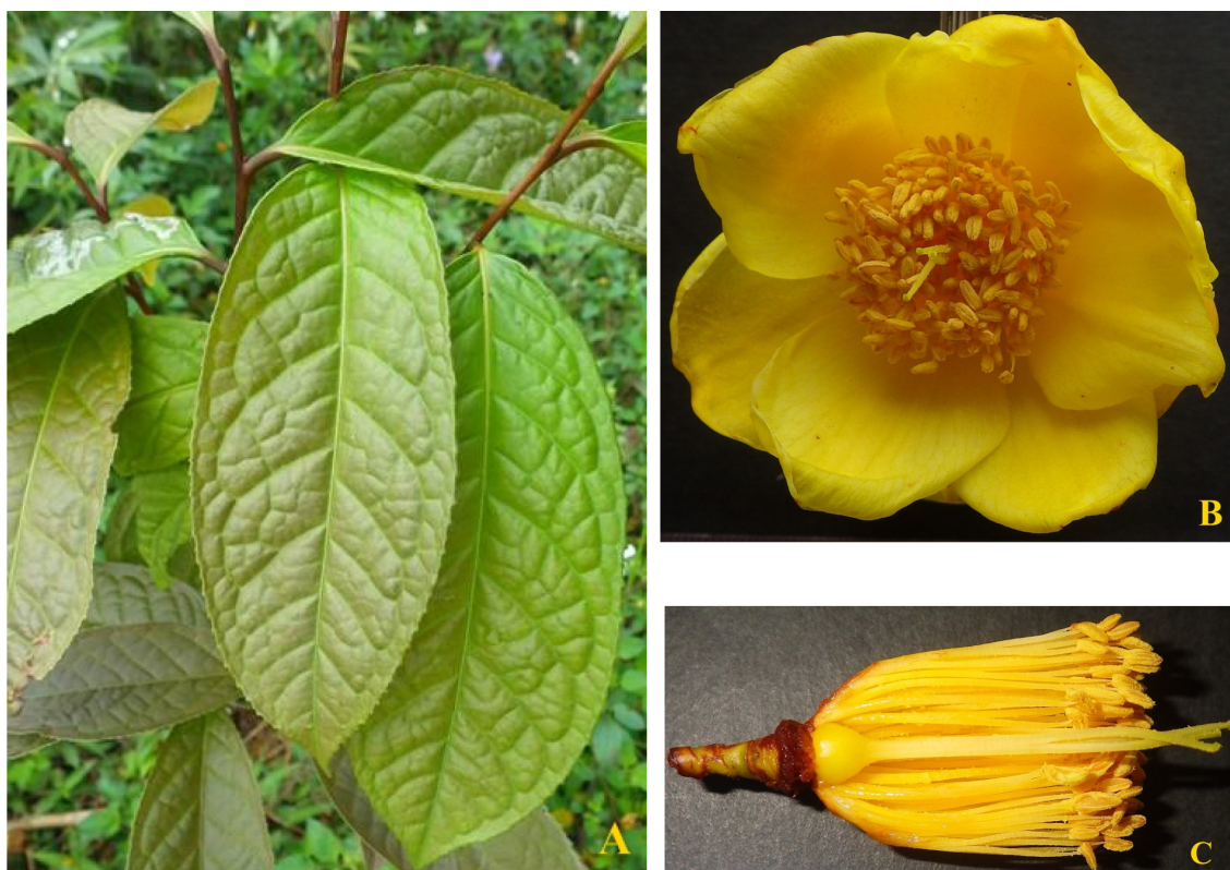
Fig. 2. Camellia tuyenquangensis D. V. Luong, N. N. H. Le & N. Tran. A. Leafy branch. B. Flower, top view. C. Pedicel, part of androecium and gynoecium revealed after removing other floral parts.

long, 13–20 mm wide, the middle whorl 4, elliptic, obovate, 38–45 mm long, 23–33 mm wide, the inner whorl 4, basally connate for 5–6 mm, obovate, elliptic, 42–45 mm long, 24–30 mm wide, glabrous on both sides. Stamens 250, in 4–5 whorls, outer whorl connate for 10–14 mm at the base, adnate to petal bases, anthers yellow, 2–2.5 mm; filaments glabrous, 25–30 mm long. Ovaries 3-locular, ovoid, 5 mm long, 5 mm wide, glabrous; styles 30 mm long, 3-cleft to middle or 3-cleft half the length of style. Fruit not seen.