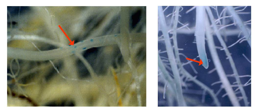
Fig. 1. Root colonization by KR083/RRj228 in Japonica rice cv. Junambyeo 6 hours after paddy water inoculation (left) and 20 days after seedling inoculation (right) with cell suspensions. Blue stain ( arrows ) indicates \beta -D-glucuronidase activity of the bacteria.

lignified cell layers in certain plants could form a barrier to the bacteria. Rhizobacterial strains KR076 and RRj228 of the present study showed protease activity, while the strain KR083 possessed pectinase activity. On the contrary, the strain KR181 didn't show either protease or pectinase activity (Table 4).