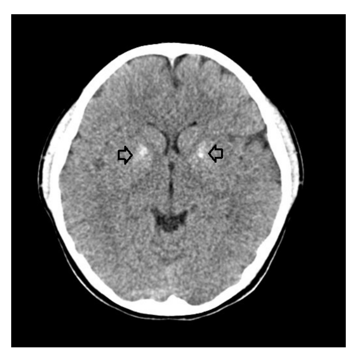
Fig. 1. Calcifications in both basal ganglia were evident on brain computed tomography.

An 8-year, 10-month-old girl, was carried into the emergency room due to 1-2 minute episode of convulsion without aura. She had complained for weeks of a tingling sensation in both hands and of fatigue. Her mother had recently noted unconsciousness and lack of reply to verbal interactions. She was born at 41 weeks of gestation by normal spontaneous vaginal delivery. Birth weight was 4.18 kg (>95 percentile). Development was appropriate to her age. Past history was unremarkable except for infantile asthma. She showed some difficulties in peer relationships at the elementary school level. A psychological evaluation