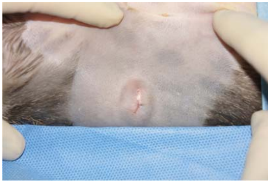
Fig. 1. Intercostal abdominal hernia of 1 cm diameter in the right 11th intercostal space was found on the physical examination.

venously and maintained with isoflurane (Ifran; Hana Pharm, Korea) in 100% oxygen via endotracheal intubation in a circle rebreathing system. Not only prophylactic antibiotics of cefazolin sodium (25 mg/kg, intravenous [IV], Cefazolin; Chong Kun Dang Pharmaceutical, Korea), but also analgesics of butorphanol (0.2 mg/kg, IV, Butophan; Myungmoon pharm, Korea) and meloxicam (0.2 mg/kg, subcutaneous, Metacam; Boehringer Ingelheim, Germany) were administered individually before general anesthesia. Body temperature was maintained at 38 to 39°C using a circulating water blanket (Medi-Therm; Gaymer Industries, USA) and lactated Ringer's solution was administered via cephalic vein during the surgery at a rate of 10 mL/kg/h. Electrocardiogram, capnography, pulse oximetry, rectal temperature, invasive arterial blood pressure, and respiratory rate (Datex AS/3; Datex-Ohmeda, Finland) were monitored continuously throughout the procedure.