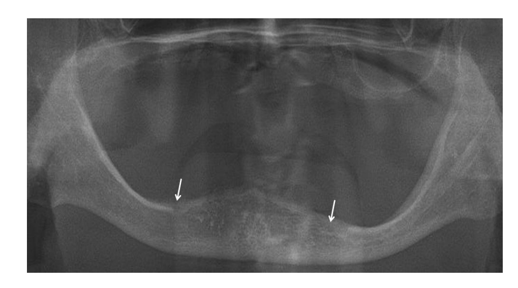
Fig. 3. A panoramic radiograph shows severe alveolar bone loss, and both sides of the mental foramen are identified near the alveolar crest level (arrow).

nications in Medicine (DICOM) format in an anonymized and randomized manner. The observers were allowed to zoom in or out and to adjust the contrast of the images. Further, they were instructed to record the reasons for any measurements that could not be made.