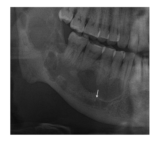
Fig. 2. The mental foramen is seen below the radiolucent lesion (arrow).

This study was approved by the Institutional Review Board of Seoul National Dental Hospital. This was a retrospective study, conducted using 300 panoramic radiographs. The radiographs of 30 male and 30 female patients belonging to 5 different age groups (40-49 years,