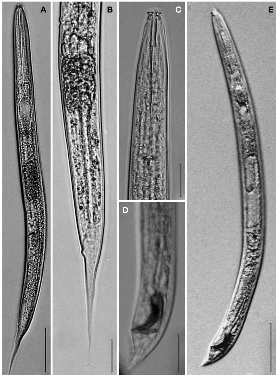
Fig. 1. Diploscapter coronatus (Cobb, 1893) Cobb, 1913. A. Entire body of female; B. Posterior part of female; C. Anterior part of female; D. Tail region with spicule of male and E. Entire body of male. Scale bars: A = 50 \mu m; B-D = 20 \mu m; E = 50 \mu m.