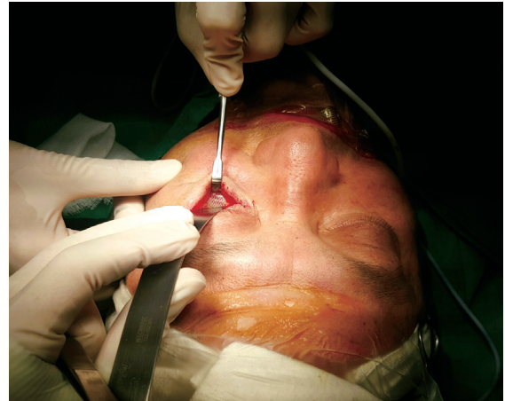
Fig. 3. Intraoperative photograph. Approach through the skin around the extruded wound. There were no visible signs of abscess or significant inflammation.