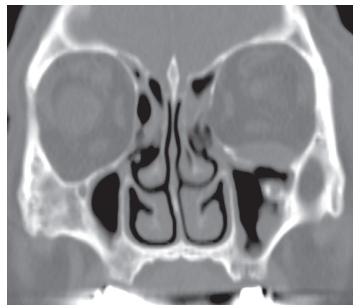
Fig. 5. Postoperative computed tomography scan. Postoperative state of the implant removal; the orbital barrier is maintained as per the preoperative state.