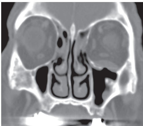
Fig. 2. Preoperative computed tomography scan. Inserted implant material is visualized at the bone defect region of the orbital floor. Enlarged soft tissue is observed around the implant.

Under general anesthesia, the skin around the exposed implant was incised and dissected to expose the orbital floor. It was observed that the implant was surrounded by a dense fibrous tissue that was firmly attached to the orbital floor within the bony defect. There was no pus or severely inflamed tissue (Fig. 3). The implant and parts of the fibrous capsule tissue were eliminated, leaving the superior dome attached to the tissue of the orbital floor, including the periosteum. Additional reconstruction of the orbital wall was not performed due to the intact orbital floor, and the absence of significant enophthalmos (Figs. 4, 5). Postoperative recovery was uneventful, and the patient was discharged 4 days after surgery.