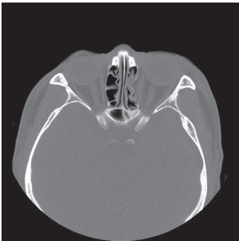
Fig. 4. Preoperative computed tomography scan. Axial views of preoperative computed tomography scans in the patients who were diagnosed with medial wall fracture.

In our series, there were no long-term complications such as the exposure of the placed implant, infections at surgical sites or foreign body reactions. In two patients who postoperatively had