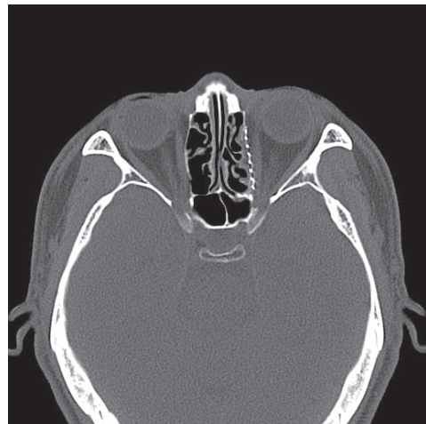
Fig. 5. Postoperative computed tomography scan. Axial views of postoperative computed tomography scans. Porous polyethylene incorporating titanium was used for the reconstruction of the medial wall fracture.