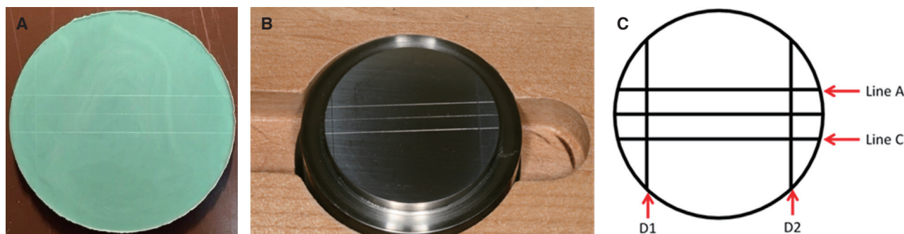
Fig. 1. (A) Representative impression material disc, (B) The metal die used for making the discs, (C) Diagram of the metal ring showing line C measurement between points D1 and D2.