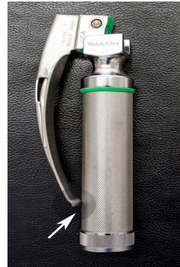
Figure 1. Photograph showing that the tip of the blade contacts an area on the knurled surface of the handle (arrow) when in the off position.

Two target hospitals and their emergency crash carts each included more than two laryngoscope blades and handles that were managed by nurses based on the same disinfection management instructions. The laryngoscope blade is disinfected using peracetic acid (Antec International Ltd., Suffolk, UK) or ortho-phthalaldehyde (Ethicon Inc., Irvine, CA, USA) from sedimentation, rinsed with distilled water, and dried. The handle is disinfected using disinfection wipes (Ebiox Ltd., Cheshire, UK).