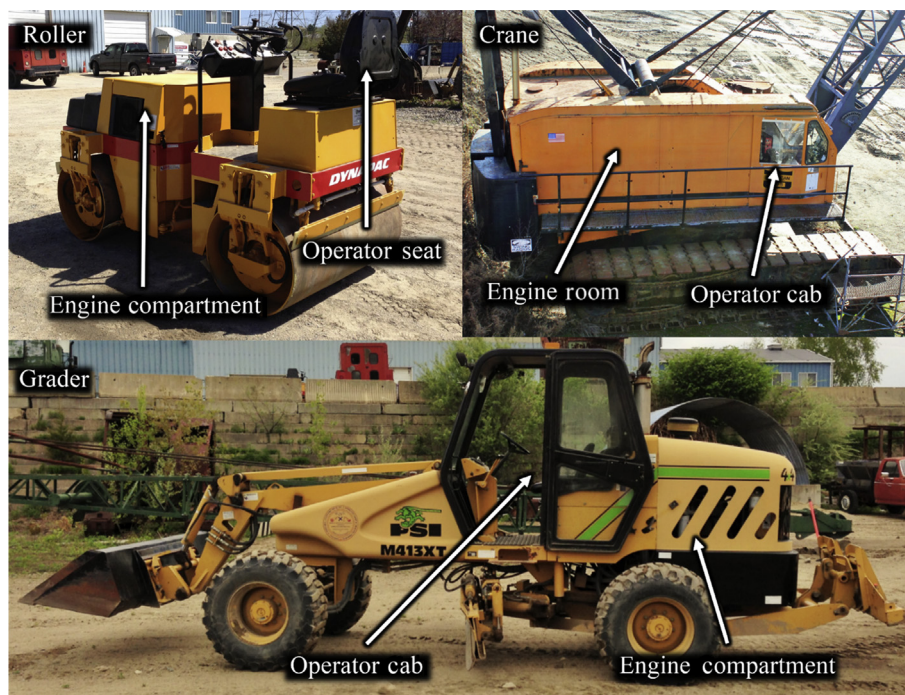
Fig. 1. The engine compartment location relevant to operator seat in three heavy-equipment machines.

The research team evaluated several types of SDMats based on their advertised noise dampening level, the frequencies of maximum attenuation, flexibility, ease of installation, thickness, and heat-resistance capability. SDMats are advertised under different names such as noise barrier material, sound deadening, and noise barrier composites. The SDMats selected for this study were manufactured by Technicon Acoustics (Concord, NC, USA) and sold by West Marine (Watsonville, CA, USA) under the name WEST MARINE Noise Control Barrier Material for use in boats to reduce engine compartment noise levels. This mat has some deadening (vibration reduction) capability but it was primarily a sound absorbing material, with its highest attenuation in the 1,000–4,000 Hz range. These SDMats were made of two layers of open-cell polyurethane foam separated by high-density polyvinyl chloride vinyl flexible sheet. The inner side of the SDMats was coated with an adhesive layer that could be attached to a metal surface. The exterior layer was covered with thin film of Mylar reinforced with elastomer-coated fiberglass providing additional surface heat protection, resulting in the material being fire retardant up to 107.2°C (225°F). West Marine sold the SDMats in 81 cm × 114 cm (32 in × 45 in.) rolls with either 1.3 cm (0.5 in.) or 2.5 cm (1 in.) thickness.