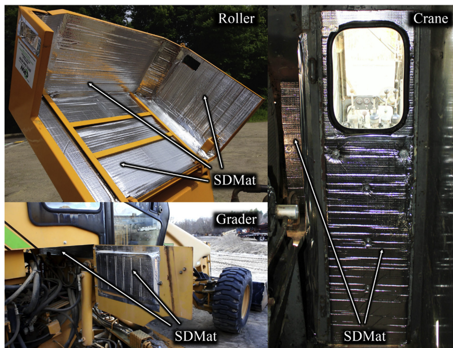
Fig. 2. Grader and roller engine compartments with sound dampening mats (SDMats) installed. In addition, crane engine room with SDMats installed on the door leading to operator cab.

For each piece of heavy equipment, four sets of SPL measurements were collected on four different settings: idle pre-intervention, idle postintervention, full-throttle preintervention, and full-throttle postintervention. The data from all tests are stationary and autocorrelated with a lag of 1. The autocorrelation-adjusted standard error, which increased by 20–30%, was used in