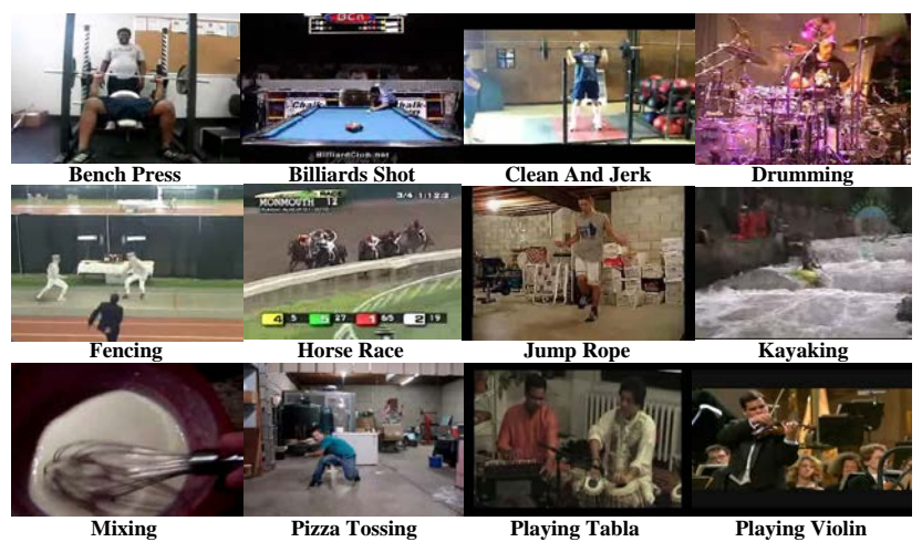
Fig. 5. Some example frames sampled from UCF50 dataset

In the experiments, we adopt leave one out cross validation for the pre-defined 25 groups, and the average accuracy over all classes is reported, the experimental results are presented in Table 4 .