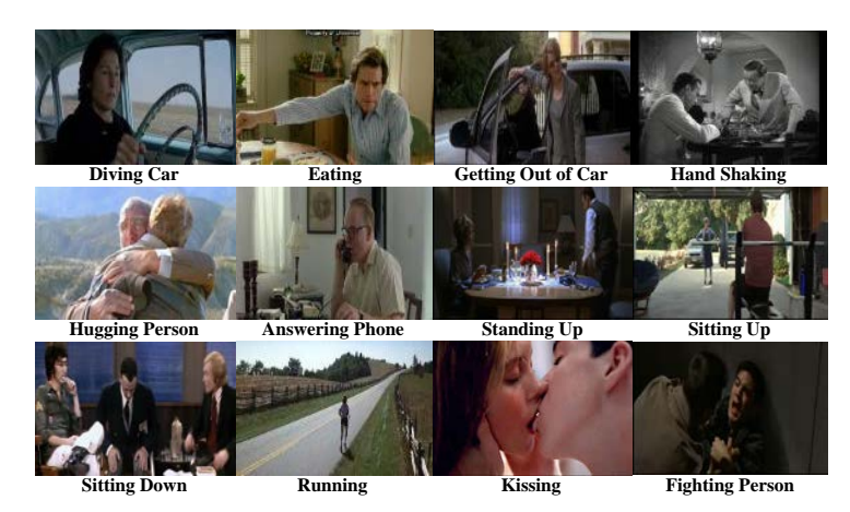
Fig. 4. The example frames sampled from Hollywood2 dataset

With regard to the experiments evaluated on Hollywood2 dataset, we report the mean average precision (mAP) [25] over all action classes, the experimental results are shown in Table 3 .