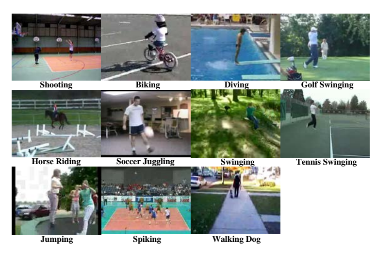
Fig. 3. The example frames sampled from YouTube dataset

The YouTube [26] dataset includes 11 actions, and has 1168 video clips in total. Recognizing the human actions of the video clips in YouTube dataset is very challenging, since these video clips are recorded under cluttered background. The example frames sampled from YouTube dataset are shown in Fig. 3.