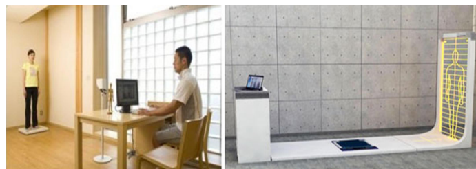
Figure 1. Shisei Innovation System PA200

were taken with the PAPS and analyzed with a whole-body posture analyzer. The Shisei Innovation System (PA200, Japan) can measure whole-body posture from the anterior, posterior, left, and right directions. Furthermore, it can analyze the postural balance, discern the differences in neck/pelvis heights, measure body deviations from the centerline, measure the upper/lower body rotation, and analyze O- and X-shaped lower limbs (Figure 1). In this study, the magnitude of head tilt, shoulder heights, and pelvis heights were measured before and after the exercise and analyzed (Table 2).