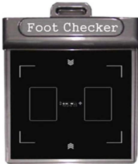
Figure 2. Foot checker