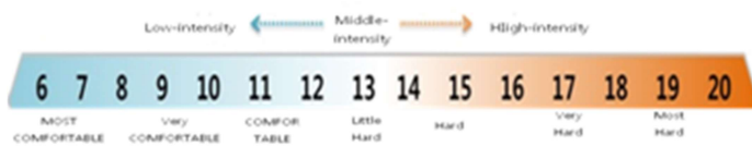
Figure 4. Rate of Perceived Exertion, RPE (Borg, 1998)