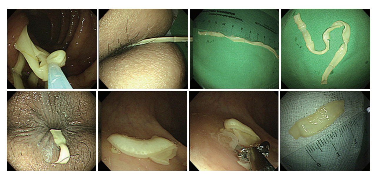
Fig. 3. The tapeworm is removed by a snare and biopsy forceps. The size of proglottids was 2.5 x 0.6 cm. The removed proglottids had slow contracting motility.