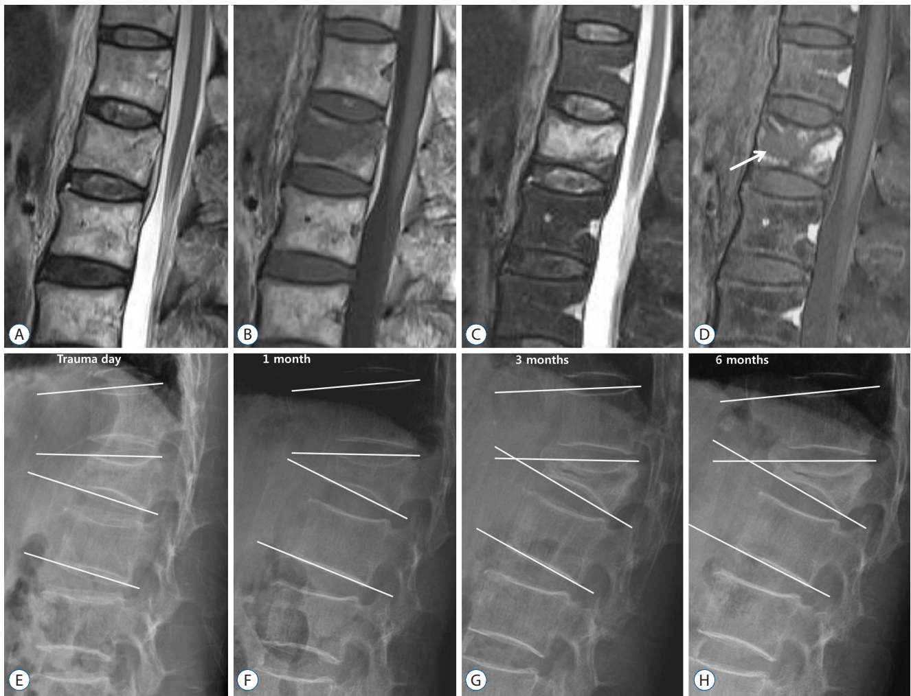
Fig. 3. A 76-year-old man with a benign osteoporotic vertebral fracture of the first lumbar vertebra. On (A) T2-, (B) T1-, and (C) fat-suppressed T2-weighted MRI, the signal of the vertebral body appears as isointensity and low and high signal intensity rather than as signal void. On (D) contrast-enhanced MRI, an area (arrow) with low signal intensity (necrotic area) is clearly shown within a diffusely enhanced area (edematous area). (E-G), and (H) on plain lateral radiography, there was a gradual reduction of disc height, and the conversion of wedge and segmental angles into a kyphotic change was found over time. MRI : magnetic resonance imaging.

Moreover, the enhancing pattern of a fractured vertebra on CEMRI is useful to assess blood supply in bone contusions. Additionally, the ischemic necrotic area on CEMRI can be used to predict the pattern and amount of injected bone cement when percutaneous vertebroplasty was performed 11) . The present study also showed further compression developed in proportion to the necrotic portion on CEMRI in OVf. This indicates that the degree of further compression is readily predictable through CEMRI, and thus it would be helpful for selecting patients requiring vertebroplasty, kyphoplasty, or surgery.