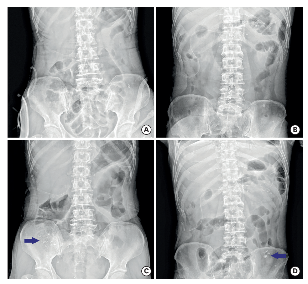
Fig. 1. Remnant sitz markers in the small intestine on abdominal radiograph of patients in the A and NA groups. (A) Patient in the A group have more sitz markers in the small intestine on postoperative day 1. (B) Patients in the NA group also have more sitz markers in the small intestine on postoperative day 1. (C) Most of the sitz markers (arrow) have passed through the IC valve by postoperative day 3 in patients in the A group. (D) Some migration of sitz markers (arrow) in the small intestine is detected on postoperative day 3 in patients in the NA group, but none have passed through the IC valve.

A = acupuncture; NA = non-acupuncture; IC = ileocecal.