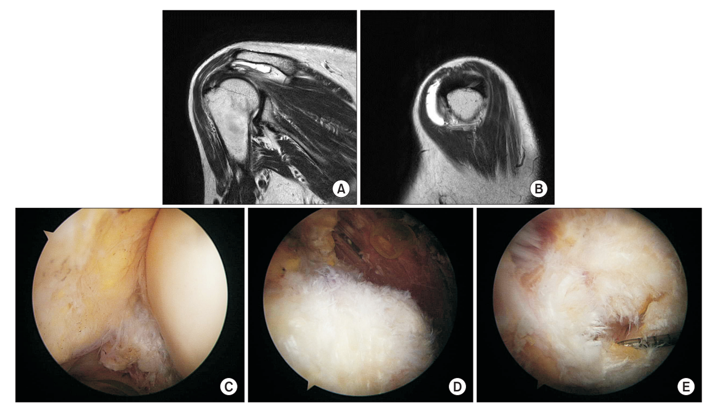
Fig. 1. (A, B) Preoperative magnetic resonance imaging of a 70-year-old female patient (ID-1) suggests concealed interstitial delamination at the anterior infraspinatus tendon. The intraoperative, arthroscopic findings revealed an articular-sided partial tear of the supraspinatus tendon (C, D) and a full thickness tear of the infraspinatus tendon (E).

Discriminating the supraspinatus muscle from the infraspinatus muscle by insertion anatomy alone is difficult. In this study, we defined and diagnosed an isolated tear as one involving the infraspinatus tendon only when the tendon in concern could be traced to the belly of the infraspinatus muscle on MRI and to the scapular spine arthroscopically, in a way that is clearly distinct from the supraspinatus tendon. In other words, we included only patients who had an all-thickness tear that was at least 2.0–2.5 cm away from the biceps (Fig. 1). None of the patients enrolled into our study had a bilateral injury, and 4 of the 6 patients had the injury on the dominant shoulder as opposed to