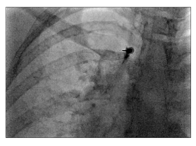
Fig. 2. Contrast spread inside SCJ sternoclavicular joint.

There are only a few reports about steroid injection into the SCJ under fluoroscopy guidance. One of these reports is the one reported by Galla et al. [6], in which 40 mg methyl prednisolone and 1 ml bupivacaine were injected