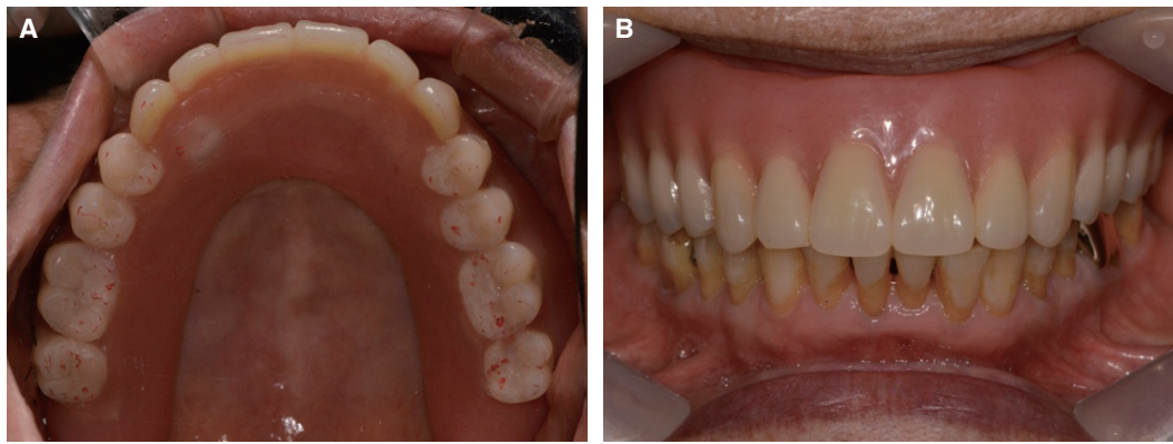
Fig. 4. (A) Implant-supported overdenture try in (occlusal view), (B) Implant-supported overdenture try in (frontal view).