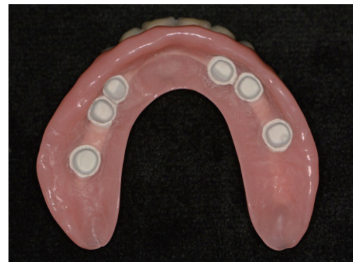
Fig. 3. Definitive implant-supported overdenture by polymer (inner side).

Polymer abutment and titanium link were sandblasted by 110 um grit aluminum oxide, and bonded with primer (SR link, Ivoclar Vivadent, Schaan, Liechtenstein) and bonding agent (Multilink N, Ivoclar Vivadent, Schaan, Liechtenstein). After that, the definitive prosthesis was made by auto-polymerized pour-type resin (Press LT, Retec, Rosbach, Germany) (Fig. 3). The telescopic overdenture was fitted intraorally (Fig. 4); the design and weight of the prosthesis were adjusted to achieve acceptable esthetics and phonetics. After 6 months, there were no problems with alveolar bone around the implant fixtures and retention of the overdenture prosthesis.