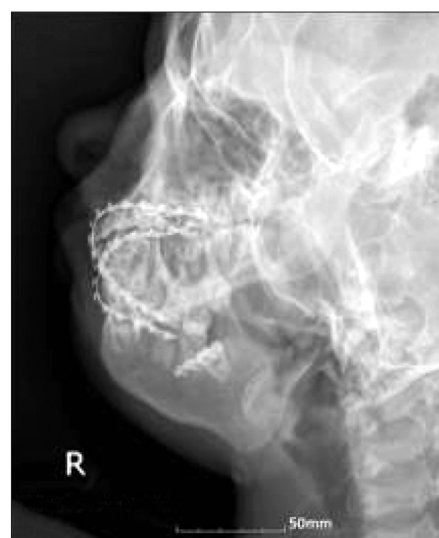
Fig. 2. Mandible series+modified Towne's view. Hye-Youn Lim et al: Evaluation of postoperative complications according to treatment of third molars in mandibular angle fracture. J Korean Assoc Oral Maxillofac Surg 2017

Panoramic radiographs and facial bone computed tomography of the patients were obtained, and demographic data, including age, sex, and medical history, were documented. All of the patients underwent ORIF surgery and perioperative IMF with an arch bar. Analgesics and antibiotics were administered in all cases for about 6 days from admission until discharge. Examination findings related to postoperative alveolar nerve function, change in occlusion, TMD, infection, and delayed union or nonunion were recorded, and ad-