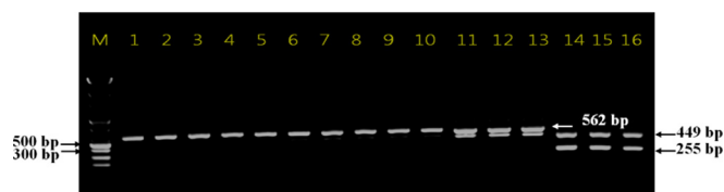
Fig. 3. Products of multiplex amplification-refractory mutation system-polymerase chain reaction using primers KgF, G-1F, AgF, and 45SR. Lane M: 1,000-bp DNA ladder; lane 1: Chunpoong; lane 2: Yunpoong; lane 3: Gopoong; lane 4: Sunpoong; lane 5: Gumpoong; lane 6: Sunun; lane 7: Chungsun; lane 8: Sunone; lane 9: Sunhyang; lane 10: K-1; lanes 11–13: G-1; lanes 14–16: Panax quinquefolius . G-1 and P. quinquefolius yielded 449 bp and 255 bp for G-1F and AgF, respectively. The experiments were conducted 10 times with a large number of ginseng samples, and the reproducibility of the amplification-refractory-mutation-system results were validated.

Therefore, a simple and reliable method for the simultaneous authentication of G-1, other Korean ginseng cultivars, and American ginseng was established using the ARMS assay. Our data indicate that G-1 and P. quinquefolius can be differentiated from