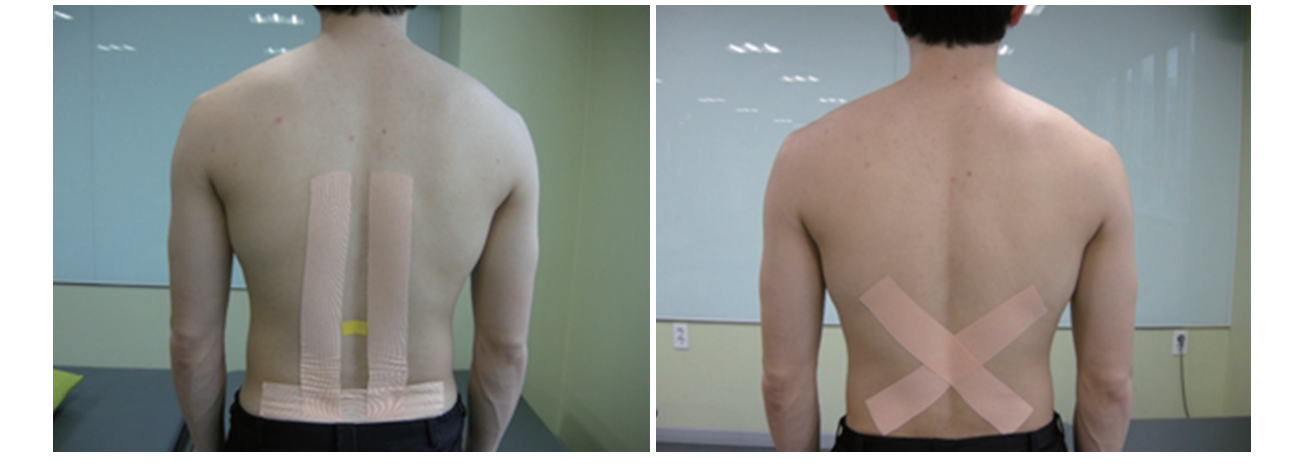
Figure 3. Application of experimental group and control group. Experimental group: kinesio taping on erector spinae and sacroiliac joint. Control group: X-taping on lumbar region

The results from comparison between pre- and post-taping for placebo effect within the control group showed no statistically significant differences in flexion, extension, right lateral flexion, left lateral flexion, right rotation, and left rotation (p > 0.05)(Table 3).