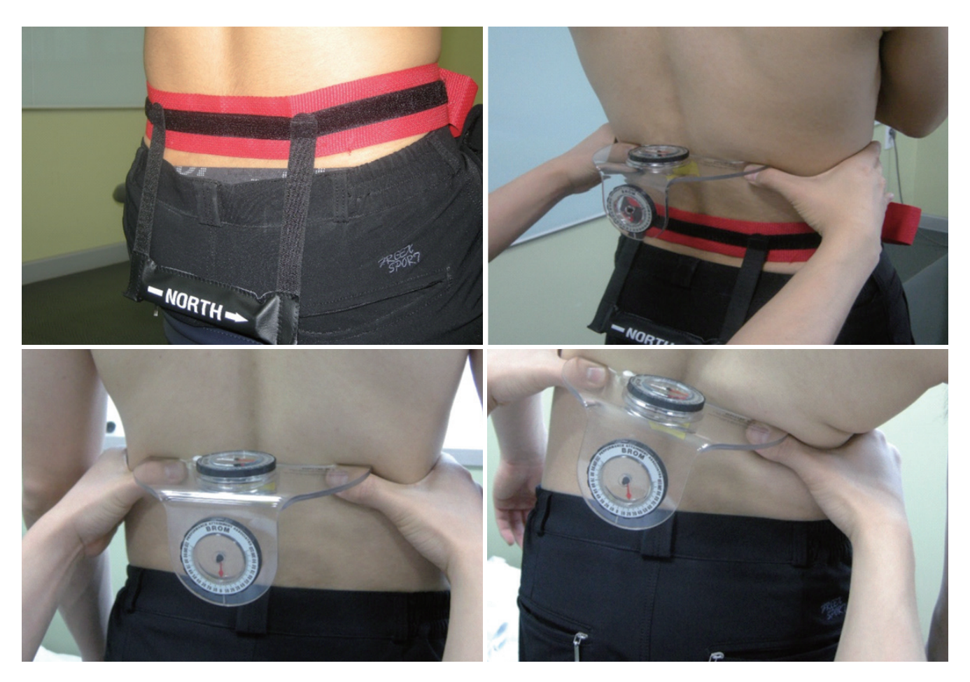
Figure 2. Rotation and lateral flexion examination by BROM (back range-of-motion instrument) II.

The subjects were randomly assigned to either the experimental group (taping applied to the erector spinae and SI joint) or the control