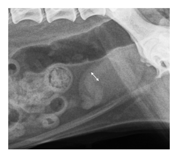
Fig 1. Right lateral abdominal radiograph of an intact female dog. There is a tubular soft tissue opacity within the caudal abdomen, consistent with the uterus (double-headed arrow). This dog was thus classified into the observable group. There were no remarkable findings in the uterus on subsequent ultrasonography examination.

bral body. The basic characteristics of the included dogs (age, sex and body weight) and all the relevant clinical data were obtained from medical records.