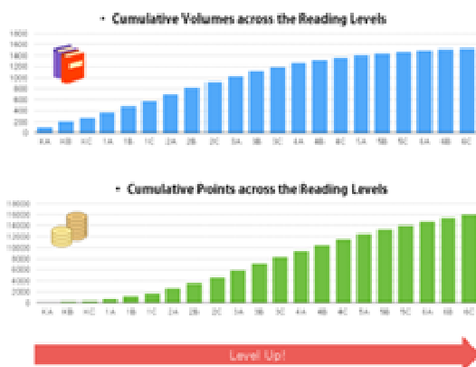
Fig. 2. Online Level-up System

To illustrate the online level-up system, students normally need to read 100 books for their level up. As the following table shows, a point is given when a reader has passed the current course after reading a book. The point value is set for each book and marked on the cover of the book. The point value is determined based on the level of the book, word counts, and other variables of grading books.