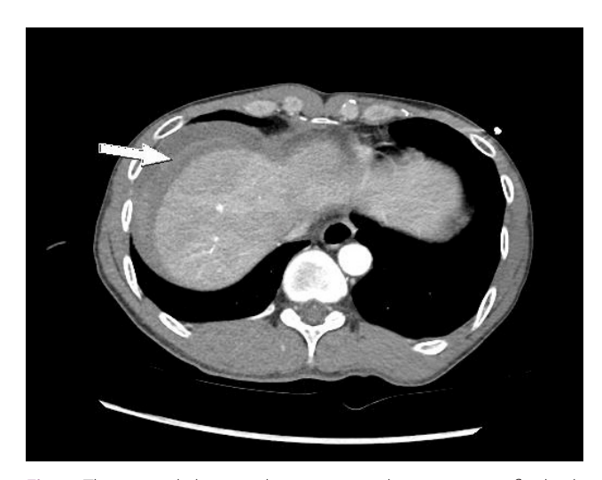
Fig. 2. The sentinel clot sign demonstrates a heterogeneous fluid collection (clot) that tends to accumulate near the site of the injury (arrow).

blood pressure was 80/50 mmHg, pulse rate was 96 beats/min, respiratory rate was 28 breaths/min, and body temperature was 36.6°C. Abdominal distension was noted, and focused assessment with sonography for trauma revealed fluid collection within Morrison's pouch and splenorenal pouch. He had received blood transfusions at another hospital and initial hemoglobin was noted to be 11.9