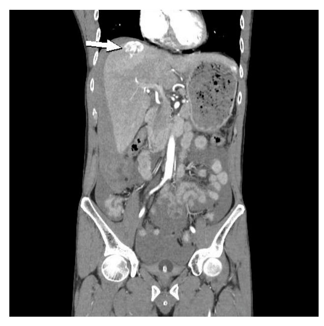
Fig. 1. Initial computed tomography reveals massive hemoperitoneum and hepatic hemangioma in the liver dome with peripheral enhancement on the arterial phase (arrow).