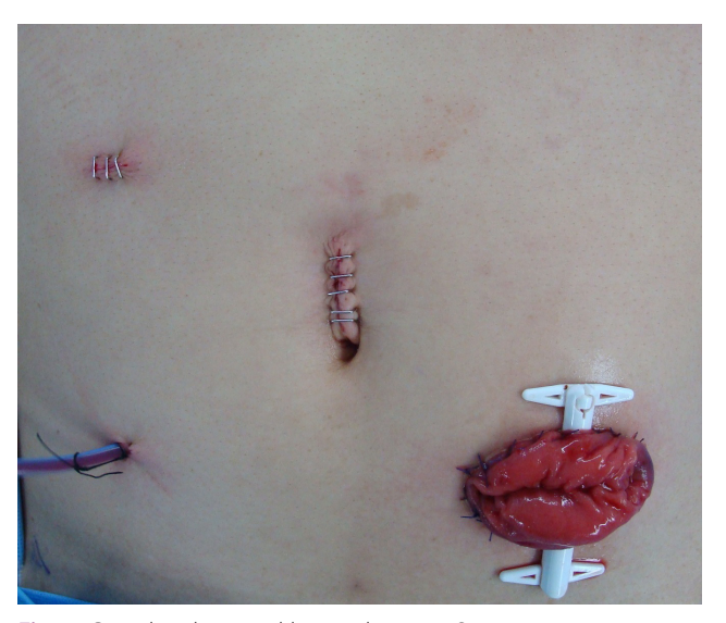
Fig. 4. Completed sigmoid loop colostomy. One 10-mm camera port and two 5-mm working ports were used.

injury. After dissection between the sigmoid colon and tissues near the colon to enable lifting to the anterior wall for the colostomy, a Jackson-Pratt drain was inserted into the pelvis for fluid drainage. After gas exsufflation, we successfully completed the loop colostomy (Fig. 4). The total operative time was 75 minutes. The patient was discharged on postoperative day 5 without any complications. Colostomy closure was successfully performed on day 75 following the original operation.