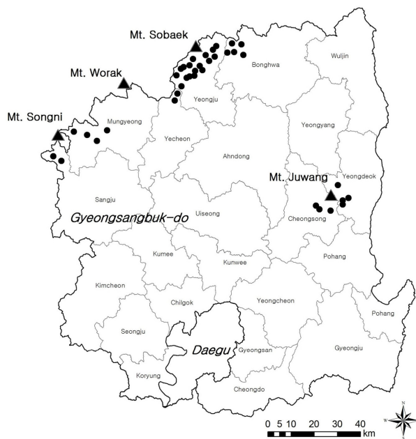
Fig. 1. Investigation sites.

For plant species identifications, Lee (1996a, b), Lee (2003), Park (2009), and Korean Fern Society (2005) were used, and a taxonomic system and scientific names followed National Institute of Biological Resources ( http://species.nibr.go.kr/ ). Native, cultivated and/or introduced plants were determined by National Institute of Biological Resources (2013) and Park