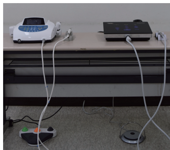
Fig. 1. TRAUS XUS10, Saeshin (Left), PIEZOSURGERY Touch (Right).

15th of 2015, they were given a self-administered survey with 11 categories of evaluation developed in this research study to evaluate their user satisfaction. 11 The performance of TRAUS XUS10 and PIEZOSURGERY touch was compared in this research study (Table 1). To exclude any influence caused by the brand and product name of the piezosurgery engine on user satisfaction during the test, blind tests were conducted without providing any information on the piezosurgery engine (Fig. 1).