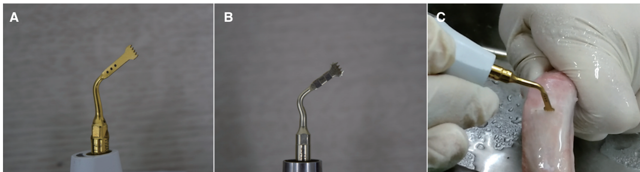
Fig. 2. Cutting the pig bone to evaluate the 'cutting ability of hard tissue, adequate bone cutting properties'. (A) OT7 (PIEZOSURGERY Touch, Mectron), (B) Sohn's Saw (TRAUS XUS10, Saeshin), (C) Pig rib sawing operation.

A score from 'very dissatisfied' at 1 point, 'dissatisfied' at 2 points, 'average' at 3 points, 'satisfied' at 4 points, and 'very satisfied' at 5 points was assigned to each of the 11 categories designed for the survey in this research study. By applying a score distribution according to the Likert point scale, the average and standard deviation values were recorded (Table 3, 4). The results of executing Kolmogorov-Smirnov and Shapiro-Wilk to verify the normality of the data con-