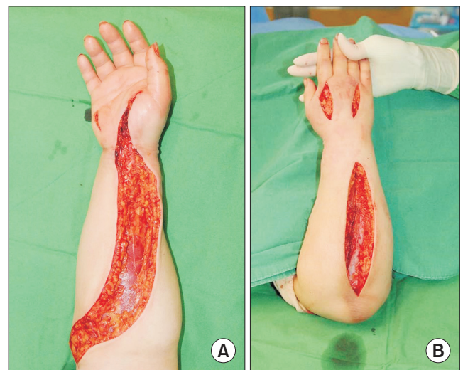
Fig. 3. Intraoperative images of the fasciotomy of the right hand and forearm: the volar side (A) and the dorsal side (B).

The patient complained of the pain to the radiologist soon after the injection, but the patient was discharged after being advised that the pain would be temporary. In AM 10, the initial pain in the right hand and wrist became severe after time, leading to swelling and redness in the forearm. In AM 11, she visited the dermatologic department and consulted to the orthopedic department because of these symptoms. In PM 2:30, the patient was suspected of having compartment syndrome induced by extravasation of the contrast media and was sent to the emergency room immediately. The patient presented with unstable vital signs: blood pressure of 174/127 mmHg, a heart rate of 120 beats/min, and a body temperature of 37.2°C. Physical examination showed multiple bullae formation on the dorsum of the right hand and wrist; swelling and redness from the hand to the distal forearm; and severe pain during finger extension (Fig. 1). Simple radiograph showed the contrast media extravasation that expanded from the right hand to the distal upperarm (Fig. 2).