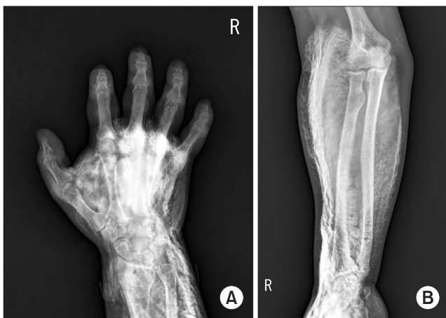
Fig. 2. Simple radiographs showing extensive infiltration of the contrast media stretching from the hand (A) to the elbow (B) after computed tomography.

The patient complained of the pain to the radiologist soon after the injection, but the patient was discharged after being advised that the pain would be temporary. In AM 10, the initial pain in the right hand and wrist became severe after time, leading to swelling and redness in the forearm. In AM 11, she visited the dermatologic department and consulted to the orthopedic department because of these symptoms. In PM 2:30, the patient was suspected of having compartment syndrome induced by extravasation of the contrast media and was sent to the emergency room immediately. The patient presented with unstable vital signs: blood pressure of 174/127 mmHg, a heart rate of 120 beats/min, and a body temperature of 37.2°C. Physical examination showed multiple bullae formation on the dorsum of the right hand and wrist; swelling and redness from the hand to the distal forearm; and severe pain during finger extension (Fig. 1). Simple radiograph showed the contrast media extravasation that expanded from the right hand to the distal upperarm (Fig. 2).