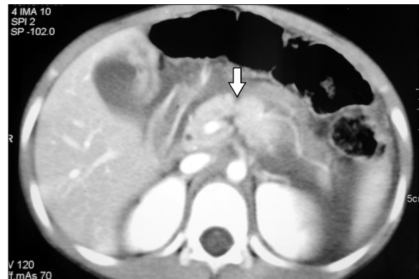
Fig. 3. Grade V pancreatic injury (white arrow).