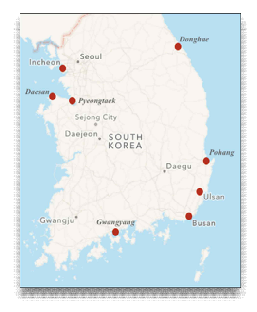
Fig. 3 Seaports in South Korea.

South Korea has achieved significant economic growth over the last decades, largely due to the adoption of export-oriented economic policies. The economic