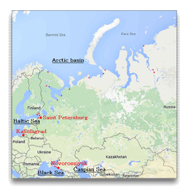
Fig. 1 Seaports in European part of Russia.

The development of ports in each sea basin has its own characteristics, formed by the specifics of the economic areas and natural conditions of navigation. Even so, most of