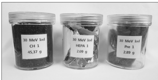
Fig. 2. Samples collected from the charcoal filter (left), HEPA filter (middle), and pre-filter (right), stored in 90 ml plastic containers.