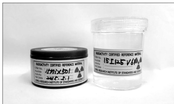
Fig. 3. Photograph of CRMs used to determine the measurement efficiency of the MCA.