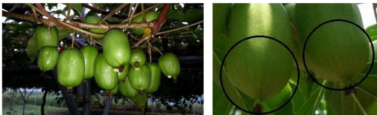
Fig. 1. Fruiting 'Mansu' (left); vertical stripes on the ends of fruits are shown in black circles (right).

'Mansu' can be harvested approximately 10 days later than the control ('Chiak'). Although 'Mansu' has very similar