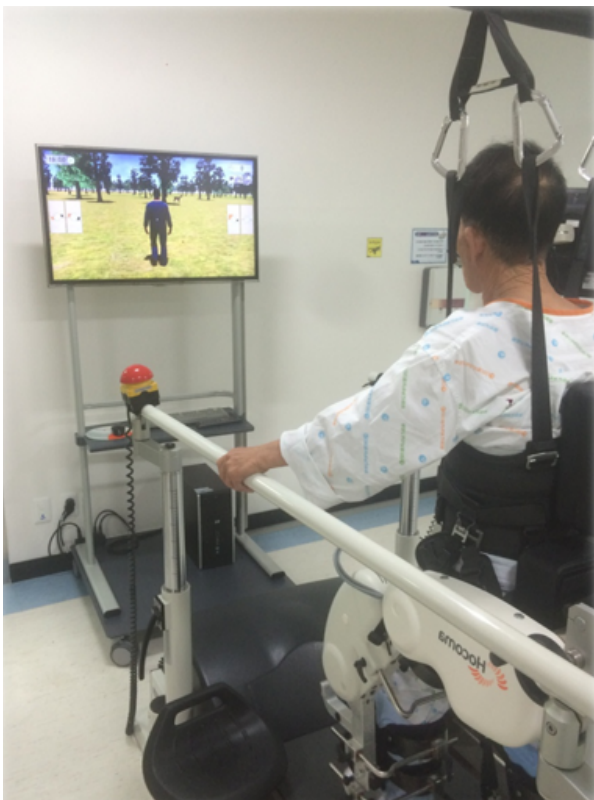
Figure 2. Visual feedback robotic device assisted gait training.

and have the ability to comprehend the study contents and follow instructions. In order to decrease the effects of selection bias, subjects were randomly allocated into either experimental group or the control group. The robotic gait-training group received general physical therapy for 30 minutes a day, five times a week for two weeks, with 45 minutes of robotic gait training, three times a week for two weeks. The control group received general physical therapy for 30 minutes, five times a week for two weeks in addition to ground gait training for 30 minutes a day, three times a week for two weeks.