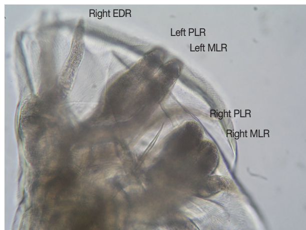
Fig. 2. Lateral view of the bursa of an adult male Ancylostoma ceylanicum . Note the parallel mediolateral and posteriolateral rays. EDR, externodorsal ray; MLR, mediolateral ray; PLR, posteriolateral ray. \times 400 magnification.

with central poorly defined abdominal pain of 4 weeks duration and increased frequency of defecation. A peripheral eosinophilia had been noted on blood tests in February prior to symptom development, and in March, when eosinophils were 6.20 \times 10^9/L whilst red blood cell indices were normal (hemoglobin 146 g/L, MCV 93 fL, hematocrit 0.44, red cell count 4.7 \times 10^{12}/L ). The patient had served with RAMSI in the Solo-