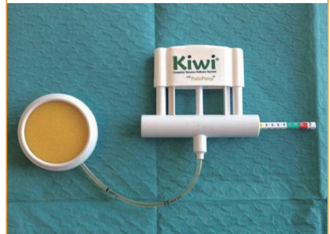
Fig. 2. Intraoperative use of Kiwi on scar tissues

The complete vacuum delivery system used: Kiwi VAC-6000M with a PalmPump (Clinical Innovations).