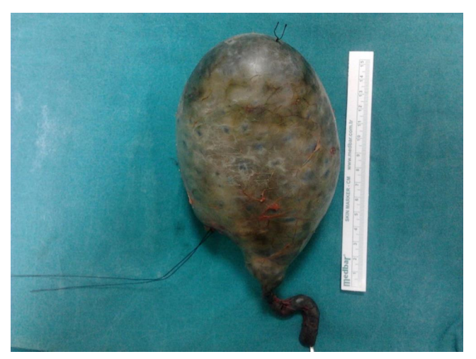
Fig. 2. 'Macroscopic appearance of the choledochal cyst (>16 cm).

to pelvic region. There was minimal dilatation at intrahepatic bile ducts. Bilateral ovaries, kidneys, and pancreas were normal. It was suspected that bile duct's dilatation was due to abdominal giant cyst's pressure. Abdominal CT findings were consistent with US (Fig. 1). She was operated with the differential diagnosis of duplication, omental or mesenteric cyst. At operation, a giant type 1a choledochal cyst, 160 mm in diameter, was surprisingly detected (Fig. 2). Roux-en Y hepaticojejeunostomy procedure was performed. Serum levels of bilirubin decreased sharply and the patient was discharged without any problems on the tenth postoperative day.