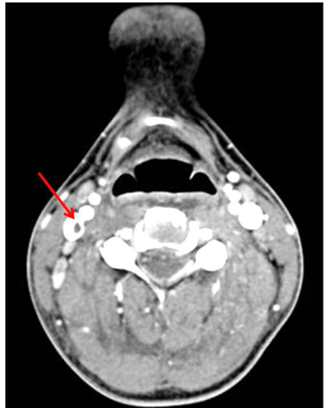
Fig. 1. Right jugular vein thrombus (arrow) was observed from the intracranial portion to the fourth C-spine level with patent blood flow.

Fever subsided on the sixth day after admission, which meant he had maintained a ten-day-long fever. On the