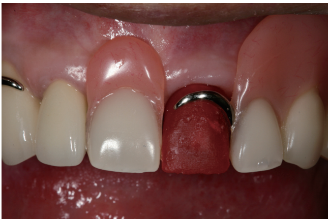
Fig. 2. Resin pattern fabricated and placed under the framework for the monolithic zirconia crown. Cingulum rest seat, labial retentive undercut, and guiding plane are captured in the resin pattern.