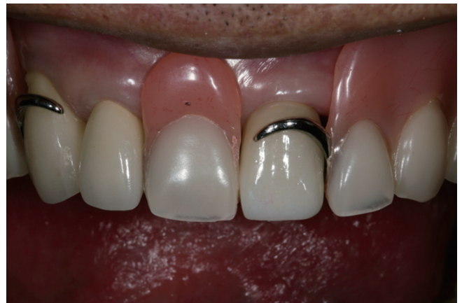
Fig. 7. Framework with definitive zirconia restoration (buccal view). The monolithic zirconia crown was adjusted and cemented.