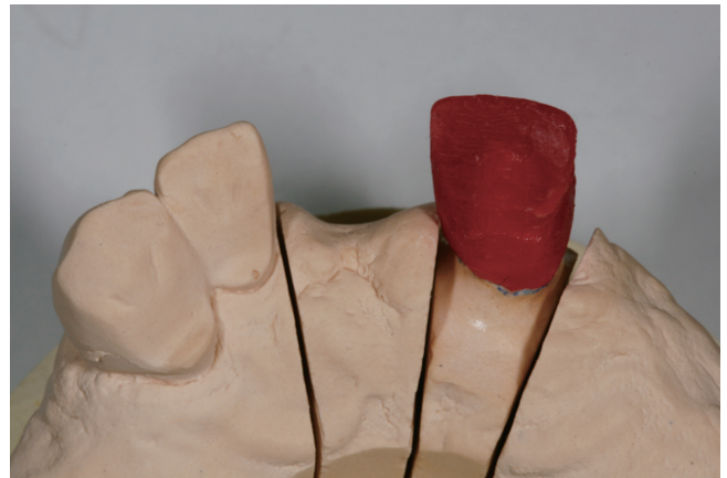
Fig. 3. Resin pattern evaluated on the working cast die to verify the fit (lingual view).