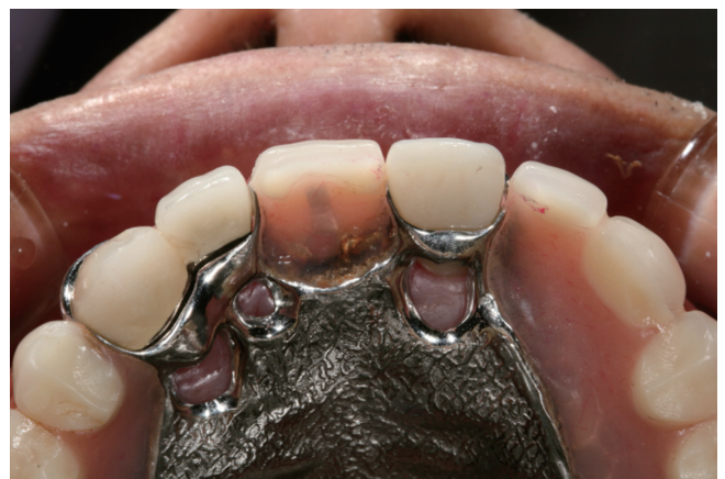
Fig. 8. Framework with definitive restoration (occlusal view). The retrofitted zirconia crown is well adapted under the existing PRDP.