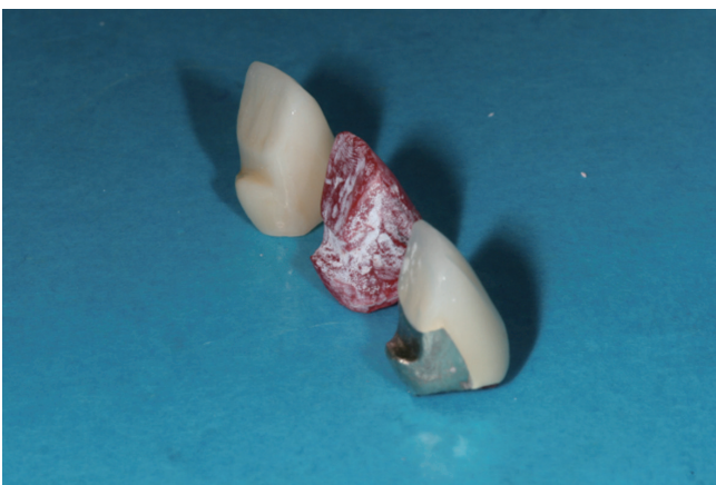
Fig. 6. Comparing the contours of the previous crown and resin pattern with the newly fabricated zirconia crown.