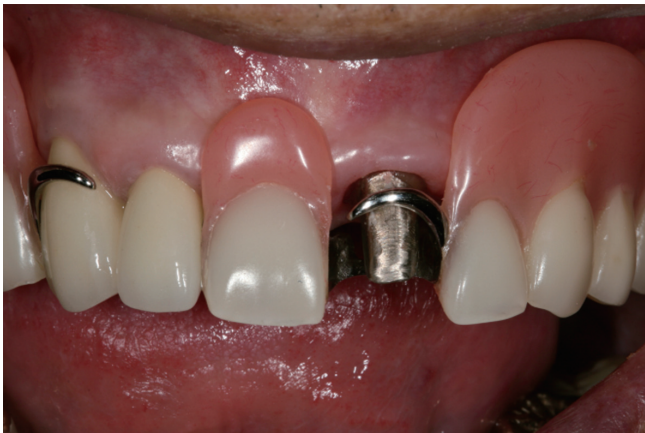
Fig. 1. Buccal view of abutment preparation for the existing PRDP. Tooth preparation finalized for impression. PRDP framework evaluated intraorally to ensure adequate reduction for the monolithic zirconia crown.