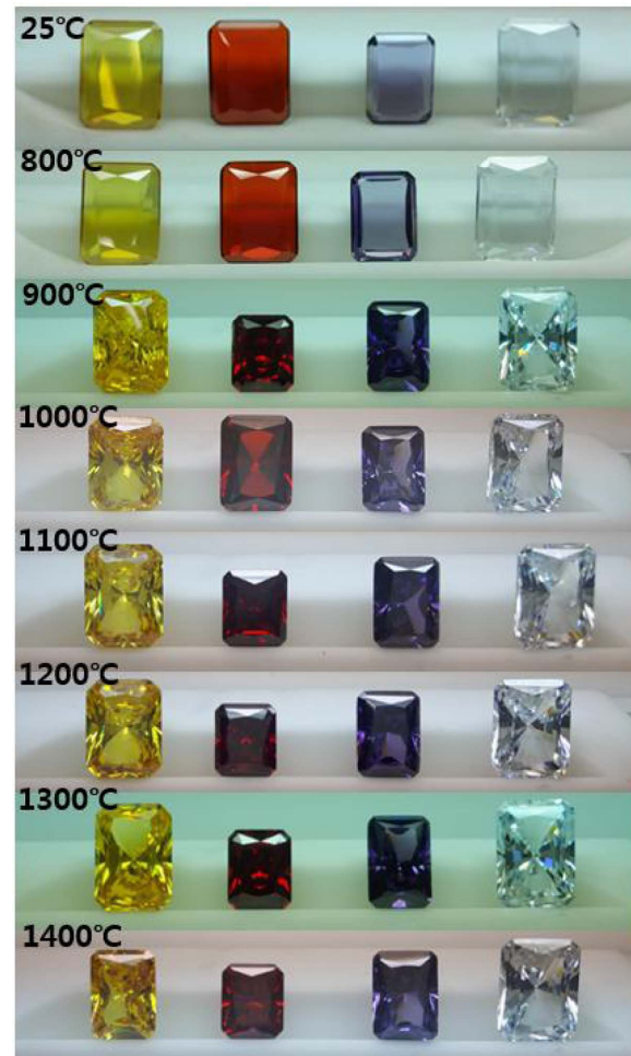
Fig. 3. Macro images of CZs after annealing at 25 ~ 1400°C in air atmosphere.

In short, there was no visual color change by vacuum annealing at 800°C and the discoloration of the colorless CZ started at 900°C. Substantial discoloration of all colored CZs started at 1000°C and complete blackening occurred at higher temperature annealing.