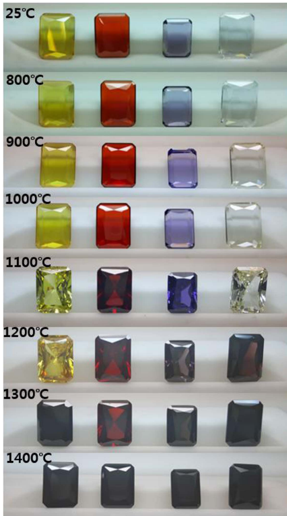
Fig. 2. Macro images of CZ after annealing at 25 ~ 1400°C in vacuum atmosphere.

cause discoloration, breakage, etc. Annealing at 900°C and 1000°C, resulted in the similar colors as those from 800°C annealing except that the edges of the colorless CZ became yellowish. Vacuum annealing at 1100°C resulted in the significant darkening of yellow, red and purple CZs. Colorless CZ was changed to a darker yellow color. In the case of 1200°C annealing, the yellow and red CZs were darkened further than those from 1100°C annealing. In the purple case, not only the color was darkened but also the inherent chroma was lowered and the color became close to dark grey. Colorless CZ became dark brown. By 1300°C annealing, yellow, purple, and colorless CZ became dark and indistinguishable. Red CZs became darker than from 1200°C annealing. Finally, 1400°C annealing turned all 4 color type CZs indistinguishably blackened. Transmission of strong back light was not observable and was not improved by the surface polishing. They cannot be used as jewel material.