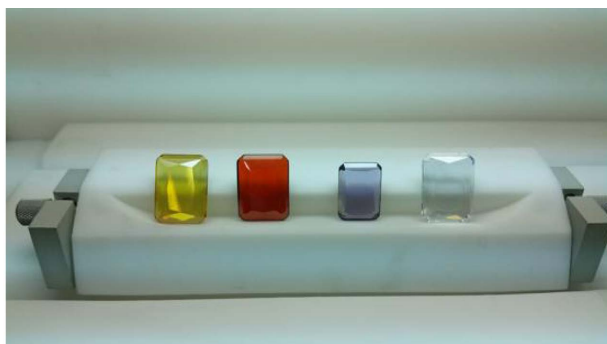
Fig. 1. Macro image of CZ reference samples (yellow, red, purple and colorless).

To check for the changes in CZ samples before and after annealing, a macro image analysis was conducted. After positioning CZs on the center part table of a diamond view