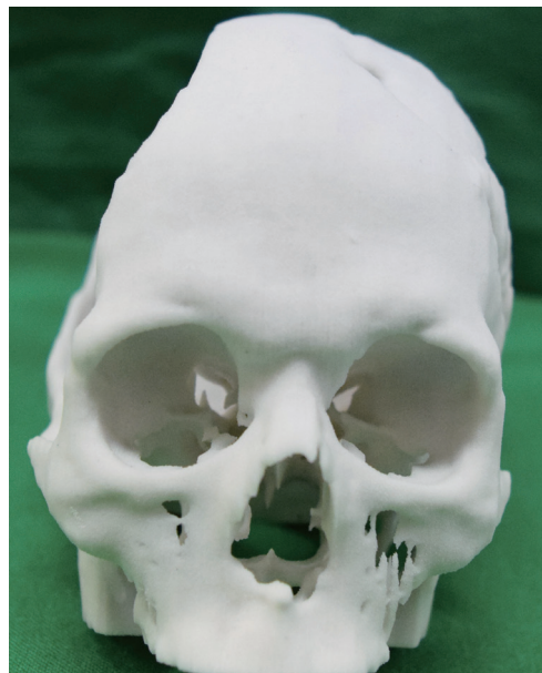
Fig. 2. Three-dimensional (3D) printing model of the patient was made using a 3D computed tomography scan.