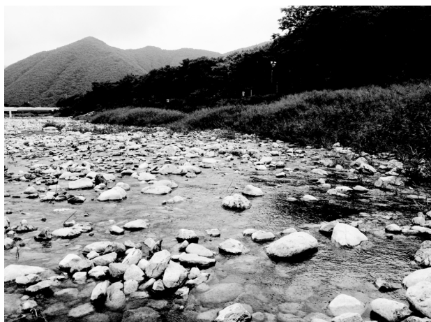
Fig. 3. Habitat of Orthotrichia coreana sp. nov. (type locality, photographed by S. Inaba on 31 Aug 2015).

of segment IX, but differs in that (1) the right anterolateral margin of segment IX is not produced anteriorly (strongly produced anteriorly in O. iriomotensis ); and (2) the paramere has a membranous swelling at basal half (the paramere lacks such bag in O. iriomotensis ). The female also resembles that of O. iriomotensis in having a flattened long ventral process and 12 sinuate marginal setae on segment VIII, but is clearly distinguished from the latter by the sinuate sclerotized distal margin of segment VIII.